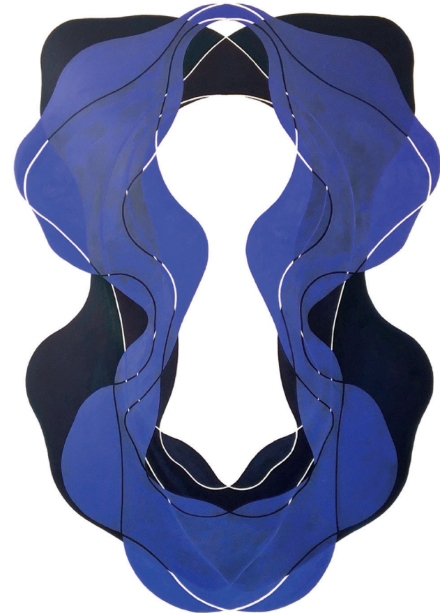
2LC SymM PoPb 21 - Oil on paper 115x90cm